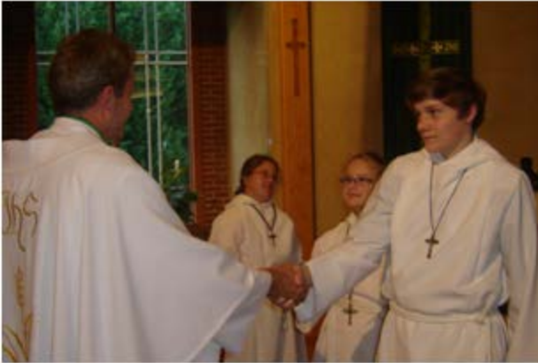
The Priest offers a Sign of Peace to each altar server