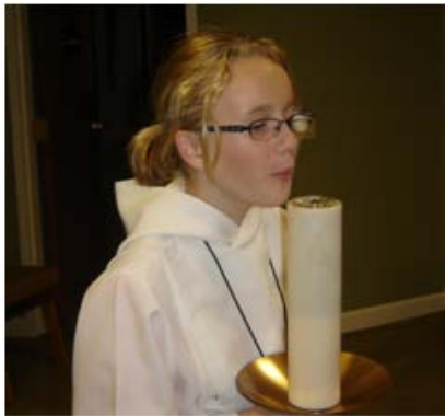
blow-out candles and place candles back on the altar