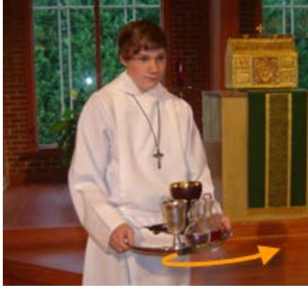
carry tray to the altar