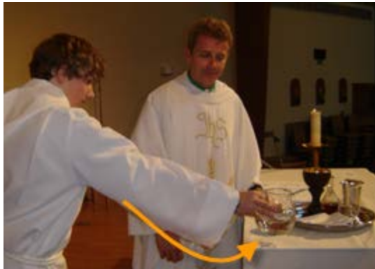
carry pitcher to the altar