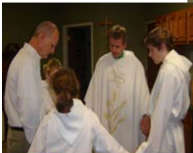
Gather in Prayer