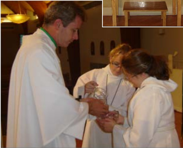
Priest washes his hands and prays, as one Candle Bearer holds the bowl and the other Candle Bearer pours water from the pitcher.