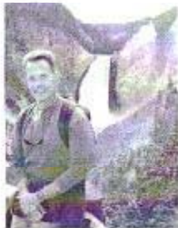
Former Pastor of St. Ann's, Naples, FL