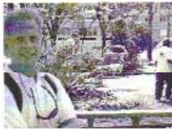
Born & reared in Philly (of course)