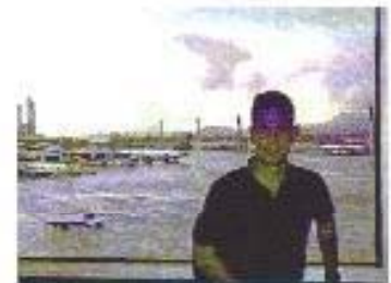
Speaks 5 languages