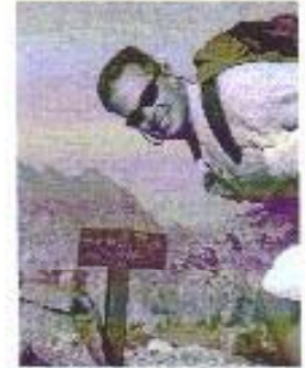
Earned his Doctorate in Rome

(*Spanish recapitulation following the 7 PM Mass)