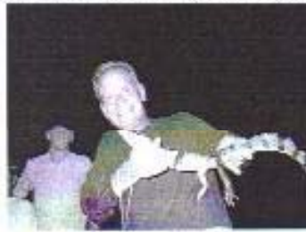
Currently Director of Provincial Administration