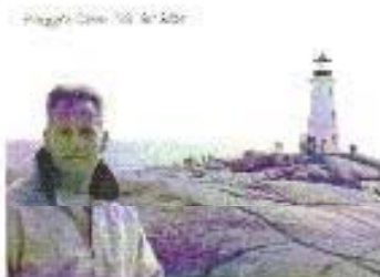
Taught Theology at the Oblate Seminary