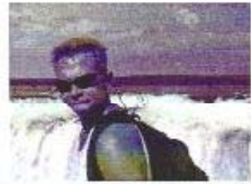
Former Pastor of IC Parish in Wilmington, NC