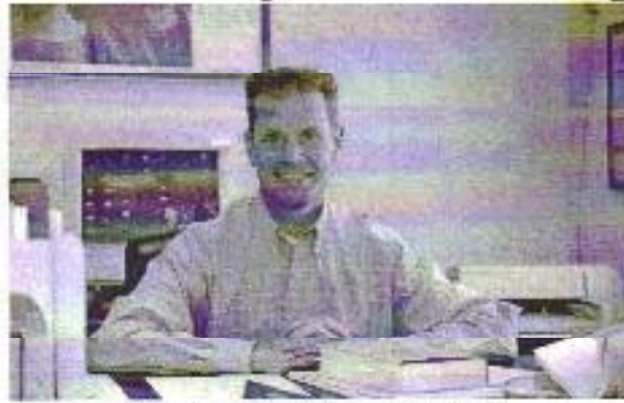
Ordained a Priest in 1984